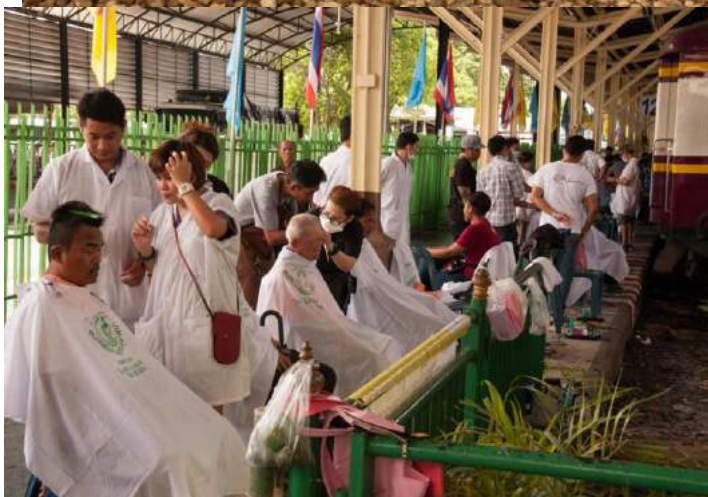
Free haircuts... pity I had one yesterday