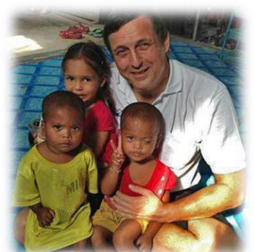
Bang Pak Trium Tsunami Village built by RCoPB-Bangkok Convention 3 Amigos - Kho Lao girl eye operation