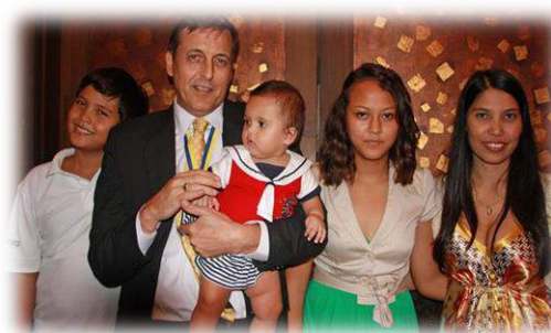
Installation Holiday Inn 2010