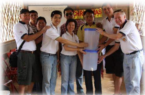
Chiang Rai Water Filters