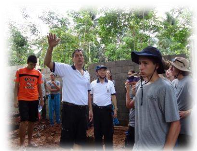
Youthline July 2014