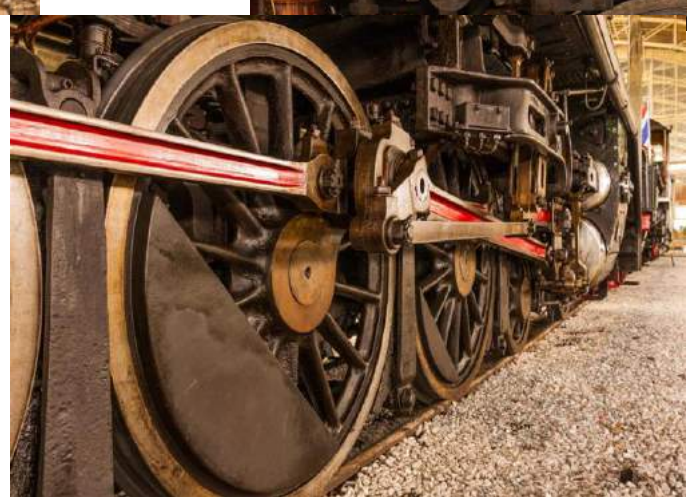
Nice to get up close & smell the oil & grease